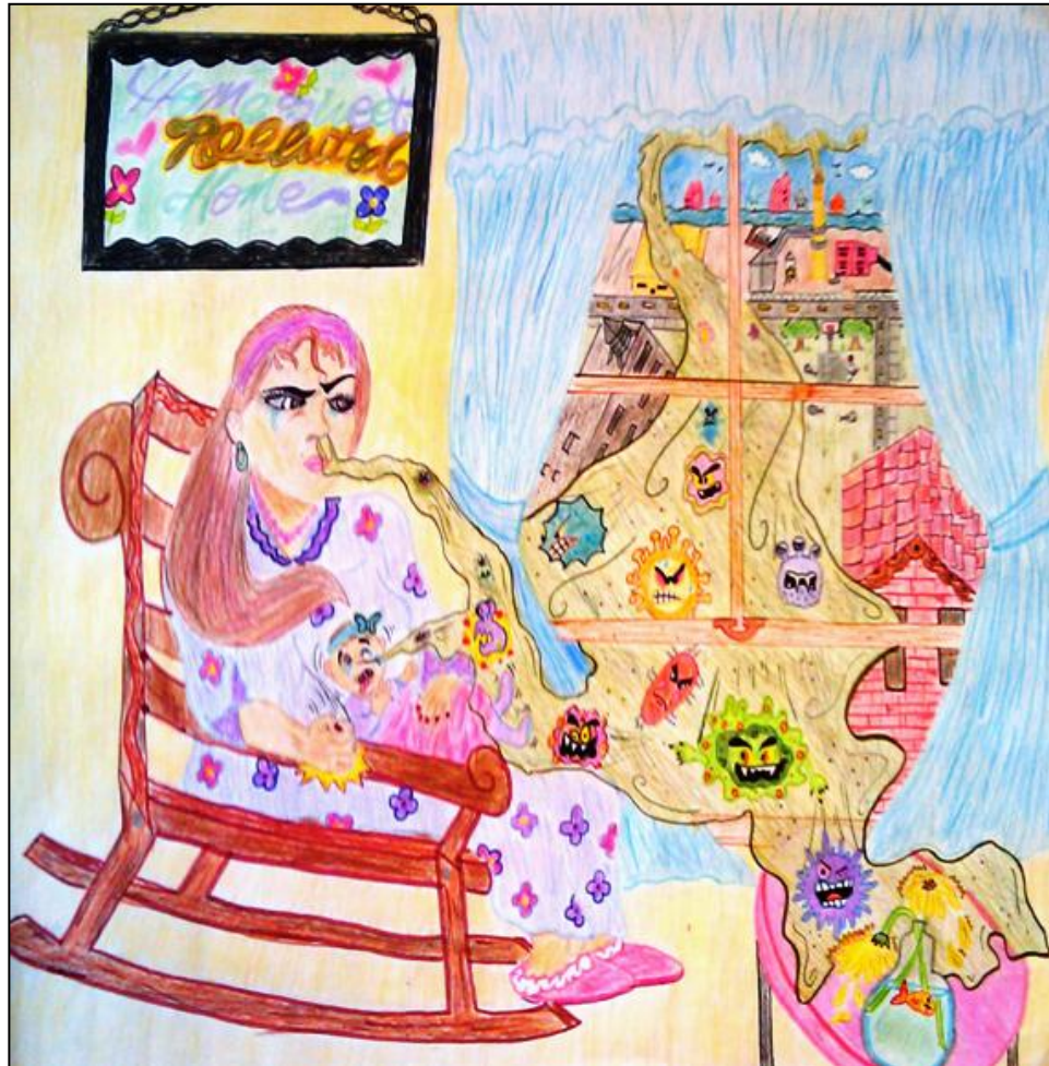
Fisk by Daniel Montes

Pollution in Pilsen: The work of local Students documenting the pollution in their neighborhood. Art show Opening at the Casa Aztlan Gallery, 1831 S Racine, 2nd Floor Friday, Aug 14, 6 PM All are welcome to learn about the sources of pollution that are affecting everyone in Pilsen! For more information contact PERRO at 312 502 7867 or redjerry2@yahoo.com or visit http://pilsenperro.org